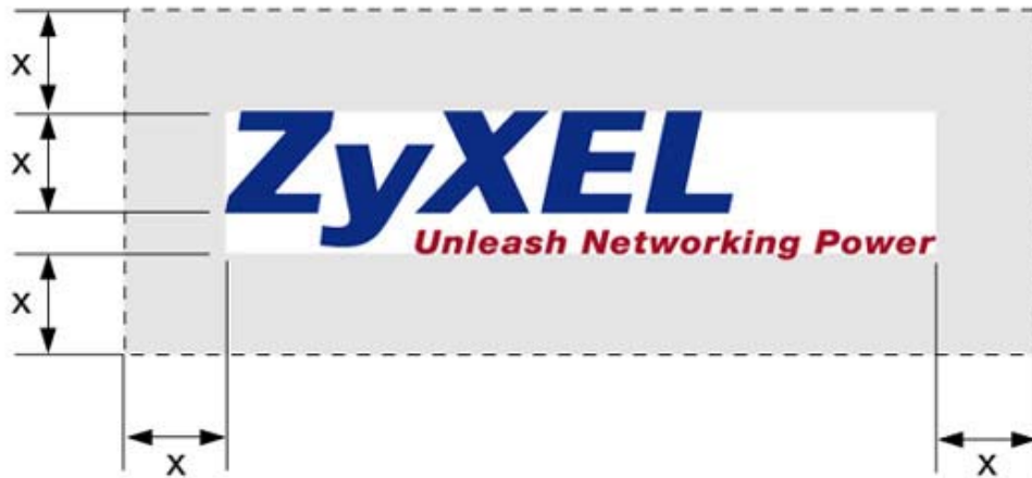
Minimum Clear Space